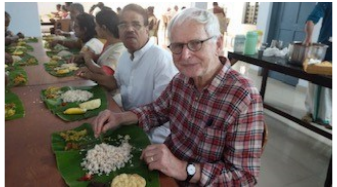
Lunch break with delicious Indian food