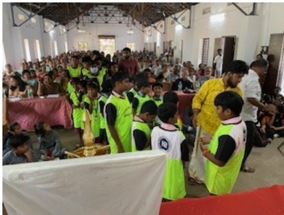
Festival in Butterfly Village