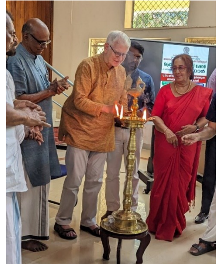
Big event at Mahatma Gandhi University in the context of »University for Third Age (U3A)