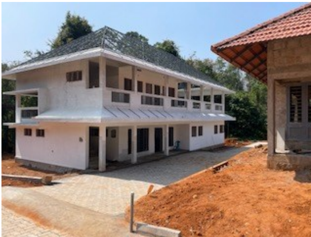
Community centre in the new village