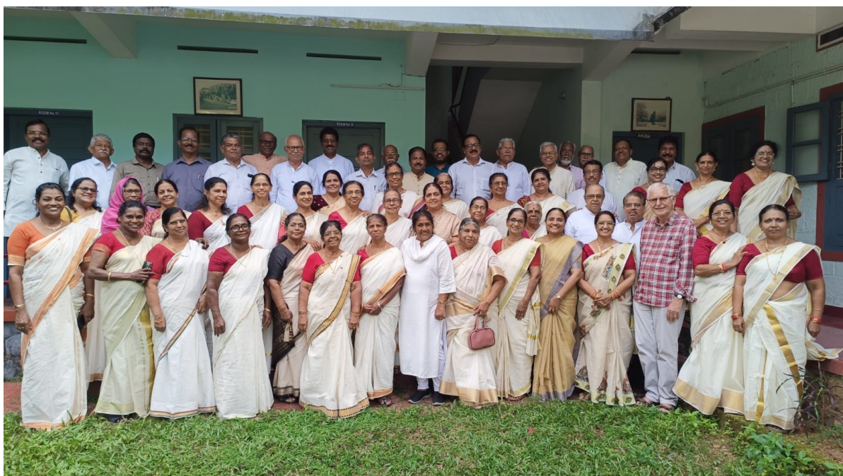
Synergy TCI Forum for Senior Citizens