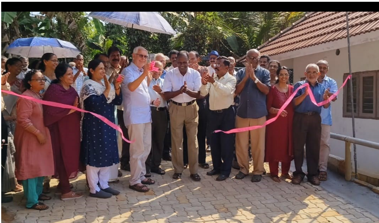
Applause for Ruth Cohn Avenue at the inauguration on 23 January 2024.