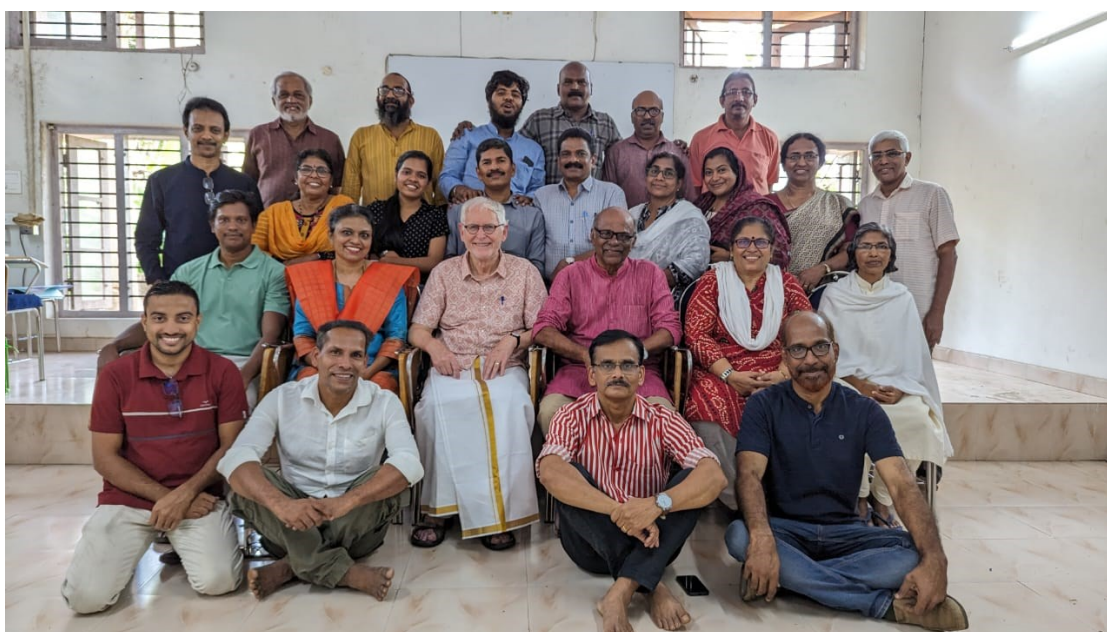
Workshop at the Mahatma Gandhi University

The venue was Directorate for Applied Short-term Programmes (DASP) at Mahatma Gandhi University, Kottayam. The international TCI workshop had 18 sessions through 12th – 15th January 2024.