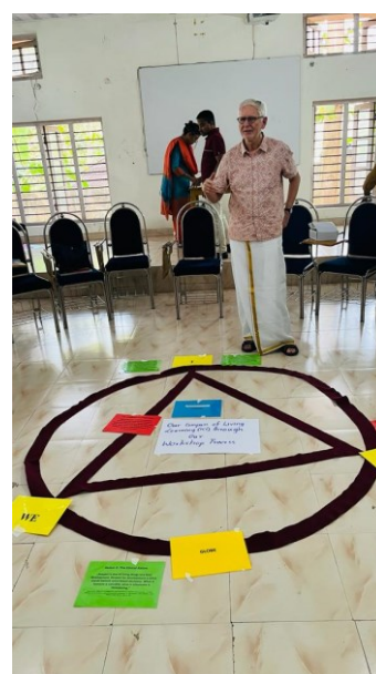
Workshop in Kerala, Photo-credit: RCI India

As a demonstration of being inclusive, Matthias placed a free chair in plenum and named it "The Other" and it continued to be there through the workshop.