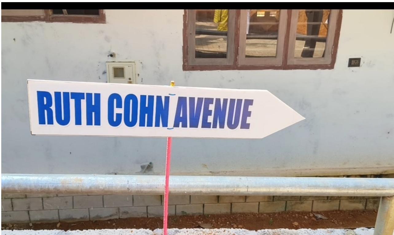
Please, this way.