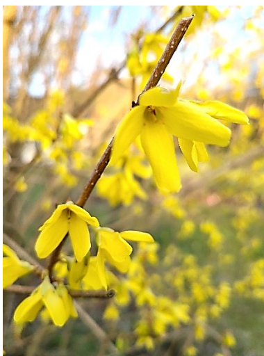
Spring