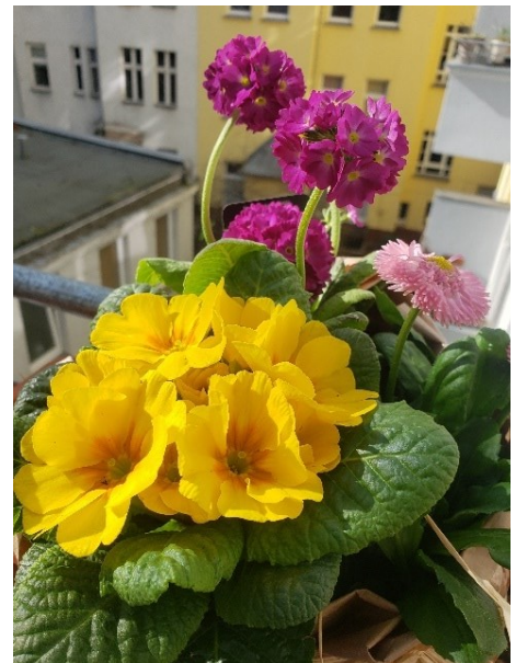
Greeting from the balcony.