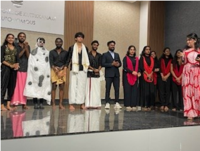
Study day with lecturers and students at Marian College "Theme-Centered Interaction (TCI) as a Pedagogic Approach for Holistic Learning in Higher Education