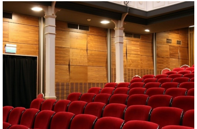
Cinema room