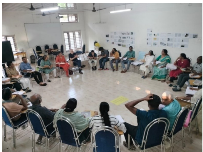
Workshop and interfaith meeting on "All-Connected into a Planetary Future"