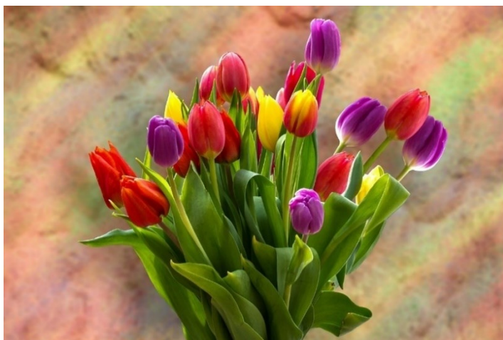
Colourful tulips for the day of honour.

We wish you good health and all the best! 🎁 🌸